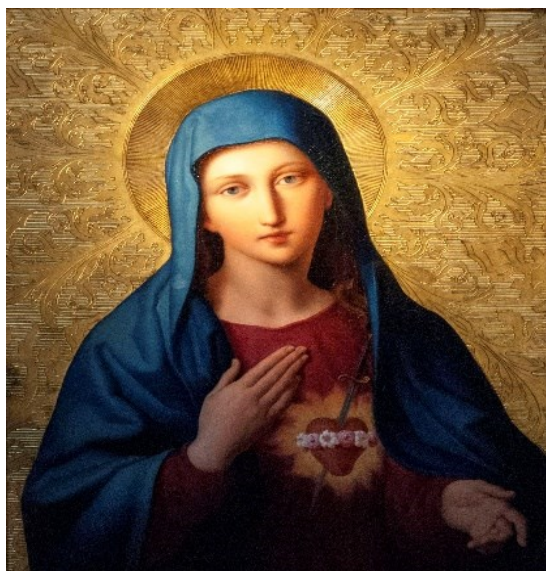
Blessed Virgin Mary